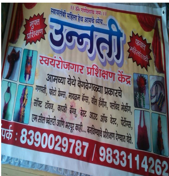
Figure 2. Unnati's Flex banners for Workshops.

1 st Unnati Workshop was conducted on 12.10.2014 at Balgovind, Marathi medium school, Andheri (E), Mumbai-400093. Total 17 participants and a leader's team of 7 people who worked hard to bring this workshop in reality. 1 st Unnati Workshop on 12.10.2014:-