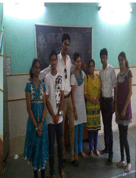
Figure 5. Leaders