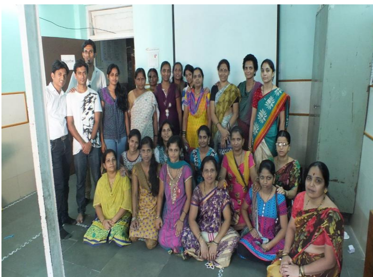
Figure 4. Participants